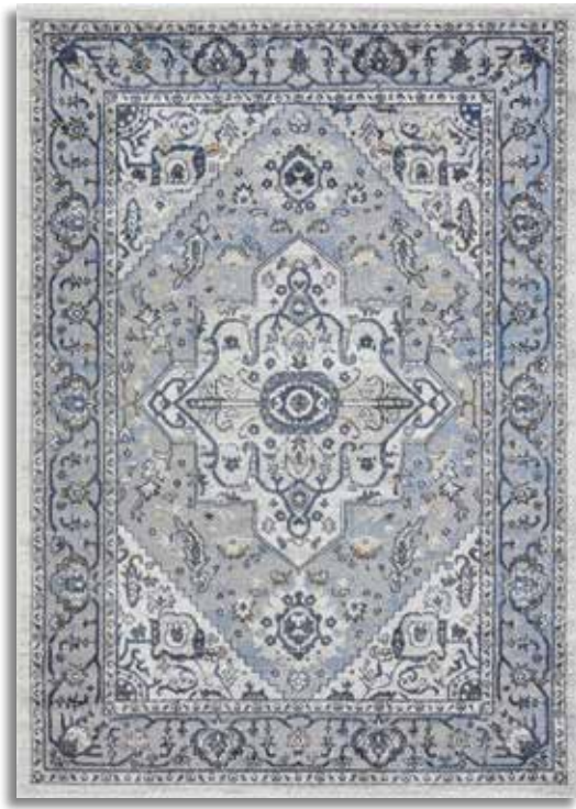
2610 20067/Blue Grey